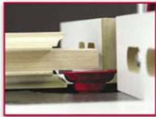
Simply by adjusting the fence and making multiple passes, virtually any tenon length can be achieved.

Always unplug the router before adjusting the router, bit, or fence.