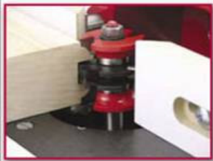
Make the stick cuts with the Stile bit. Bit configuration shown is for a 1-3/4" thick stock.

by having the ability to remove the top cutter off of the router bit and only cut the wood using the bottom part of the tool. The trick is to make a cut with the full router bit to get the bit centered in the material, then hog away most of the wood with a dado blade on the table saw to create the long tenon and lastly make the cope cut into the rail above and below the tenon only using the bottom half of the router bit.