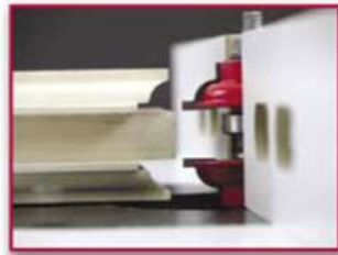
Make the cope cuts with the Rail bit. Bit configuration shown is for a 1-3/4" thick stock.