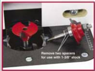
Remove the top cutter assembly of the Rail bit without adjusting the height or removing the bit from the router.