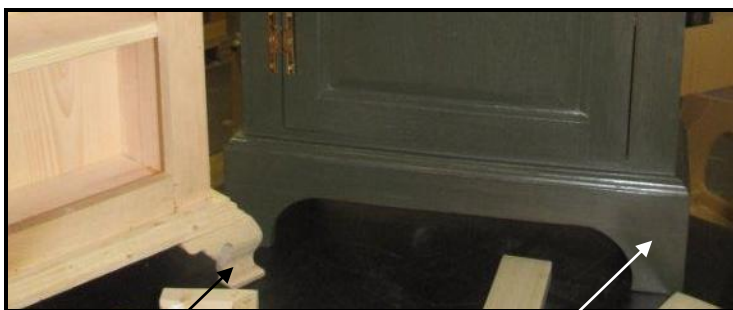
Ogee bracket foot